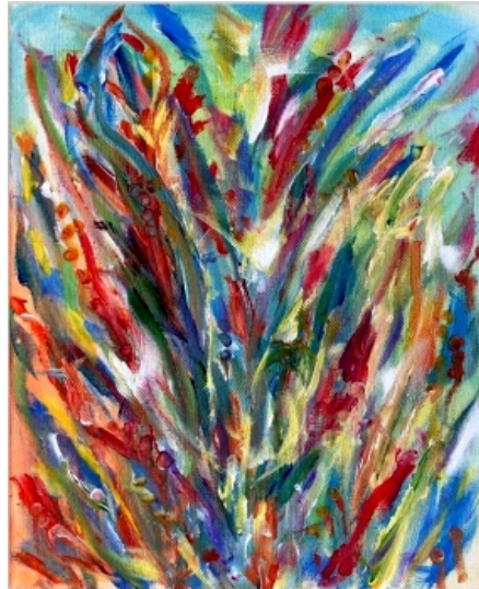
Color & Play