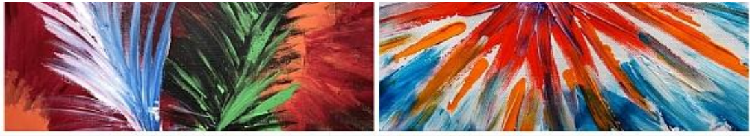
Creations by International Online Certification Program Participants

Happy New Year! We hope this newsletter finds you refreshed, relaxed, and ready for a great 2019.