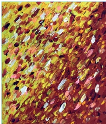
Giving and Receiving Love