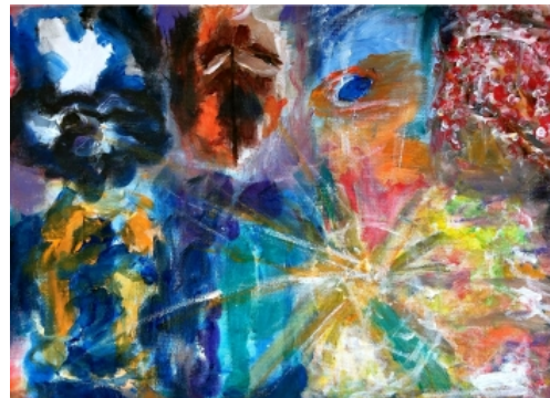
Dark to Light