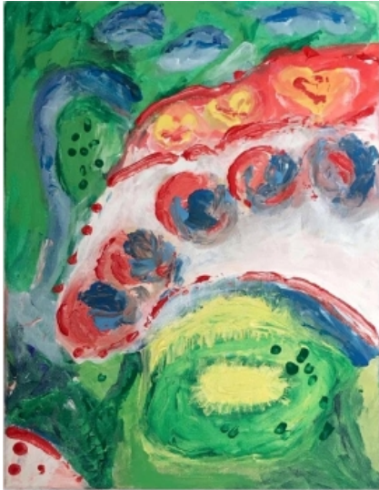
All About Me – Weaknesses & Strengths